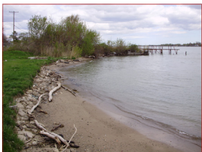
Park Acquisition Cottleville Township