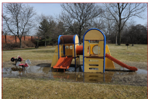
Park Repair Lathrup Village