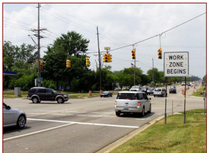
Signal Installation Novi